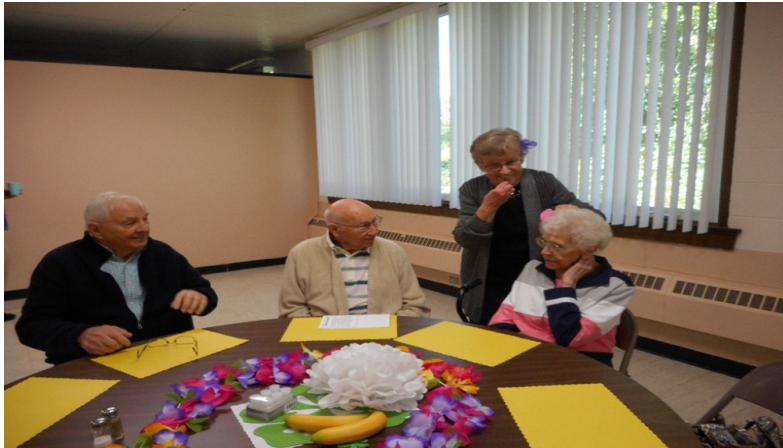
Fun and fellowship before the meal begins!

THE BIBLE CLUB RALLY DAY HELD ON SEPTEMBER 9 AFTER WORSHIPS FEATURED A LUAU THEMED LUNCHEON AND COSTUME ACCESSORIES. A GOOD TIME WAS HAD BY ALL AND THE FOOD WAS PRETTY TASTY ALSO! THE MEAL INCLUDED BBQ PORK, HAWAIIAN BUNS, COCONUT RICE, FRUIT SALADS AND A WONDERFUL HAWAIIAN PUNCH. THE DESSERT TABLE FEATURED PINEAPPLE UPSIDE DOWN CAKE, COCONUT COOKIES AND TROPICAL ORANGE CUPCAKES. THERE WERE FLOWERS FOR THE LADY'S HAIR AND FLOWER LEIS AND BUBBLES FOR EVERYONE!