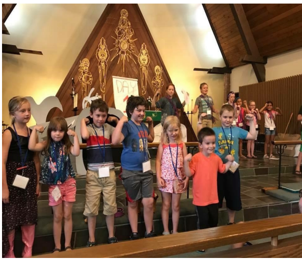
Kids from DML enjoyed another year at VBS Arts Camp at St Gregory's Episcopal Church. The camp ran from July 30 to August 2. Thanks to all who attended and helped out!